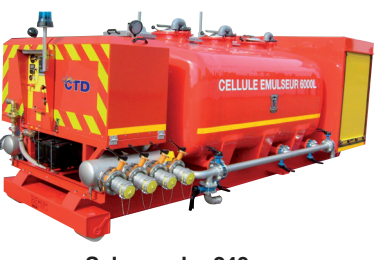
Salamandre 240 on foam concentrate skid